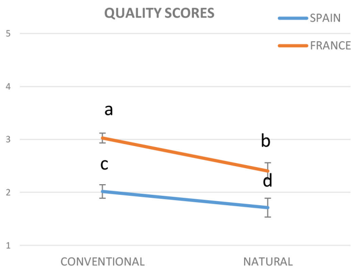
FIGURE 2. Average quality scores for the two cultures and the two types of wine. Values associated with different letters are significantly different according to a Fisher (LSD) test.

The F1–F2 plot of the CA resulting from the citation frequencies of the descriptors generated during the sorting task is represented in Figure 3. The mean quality scores for