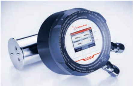
L-Com 5500 Version Ex is the explosion-proof version and specially designed for the measurement of flammable liquids in hazardous environments.

Density and sound velocity values are determined in one cycle and under the same process media conditions. An unrivaled accuracy of 5x10 -5 g/cm 3 for density and 0.1 m/s for sound velocity is achieved. Various process connections and electrical interfaces suit applications in the beverage or chemical industry.